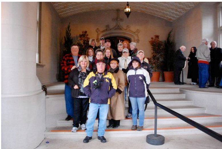
Trip to The Biltmore in Asheville, NC