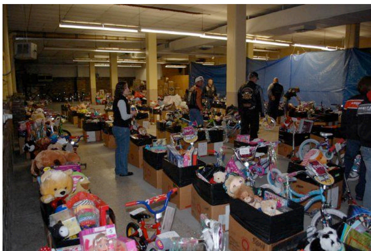
Christmas Baskets ready to go!