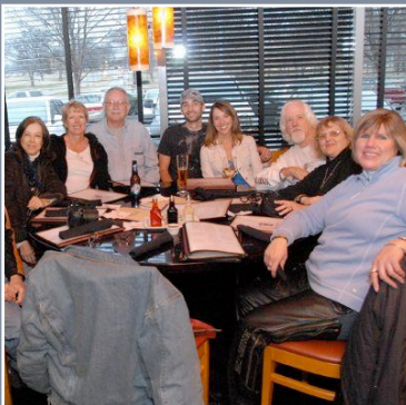
Saturday Night Social to Centennial Sportsplex and P.F. Chang's on January 23, 2010